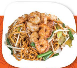
#25 Shrimp Lo Mein