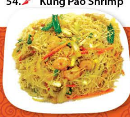
#30 Singapore Mei Fun