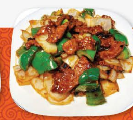
#81 Pepper Steak