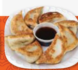
#55 Pot Stickers