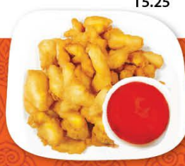
#59 Sweet & Sour Chicken