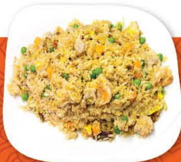
#19 House Special Fried Rice