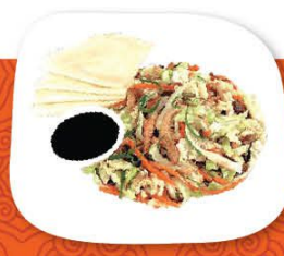
#70 Moo Shu Chicken