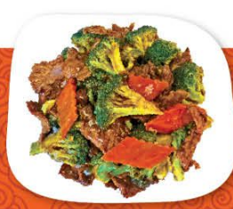
#78 Beef Broccoli