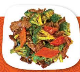
#78 Beef Broccoli