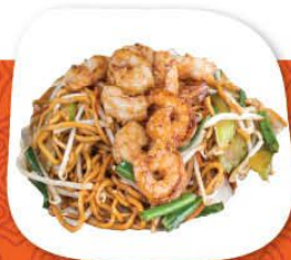
#25 Shrimp Lo Mein