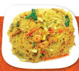
#30 Singapore Mei Fun