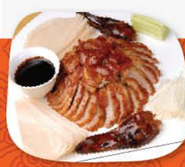
#S3 Roast Duck