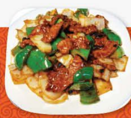
#81 Pepper Steak