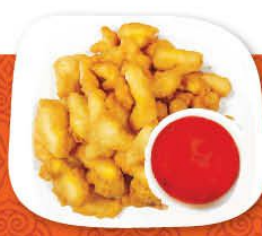
#59 Sweet & Sour Chicken