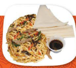
#70 Moo Shu Chicken