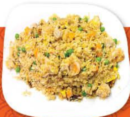
#19 House Special Fried Rice